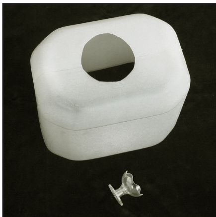
Figure 2 A translucent light box made from a 5 litre plastic container, and a small plastic stand.

First , you need to get rid of the reflections, any strong shadows, or uneven lighting. That is best achieved by putting the paperweight inside a translucent, featureless box, which has a small hole through which the picture can be taken. You can buy ready made boxes, or - as I and many others do - make a box from a translucent plastic container.