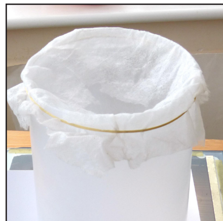
Figure 3 A translucent light box made from a waste bin, and garden fleece to soften the edge reflection.

I have used an old 5 litre white spirit container; but now use a waste paper basket! I also use a small stand to raise the paperweight a little into the air and allow some light to reach the underside - this can be an advantage for clear or translucent paperweights. The small stand shown in Figure 2 originally held a Christmas chocolate - from Thorntons, naturally! I know some collectors place a mirror beneath the weight for the same purpose.