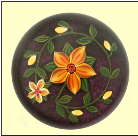
Figure 10 Cream background.