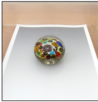
Figures 4 and 5

The set-up I use for angled images, with a graded grey background. The garden fleece can be drawn forwards to help stop reflections of objects in front of the set-up.