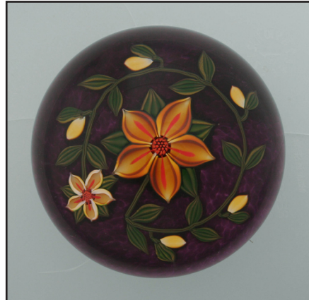
Figure 7 Original image taken in translucent box.