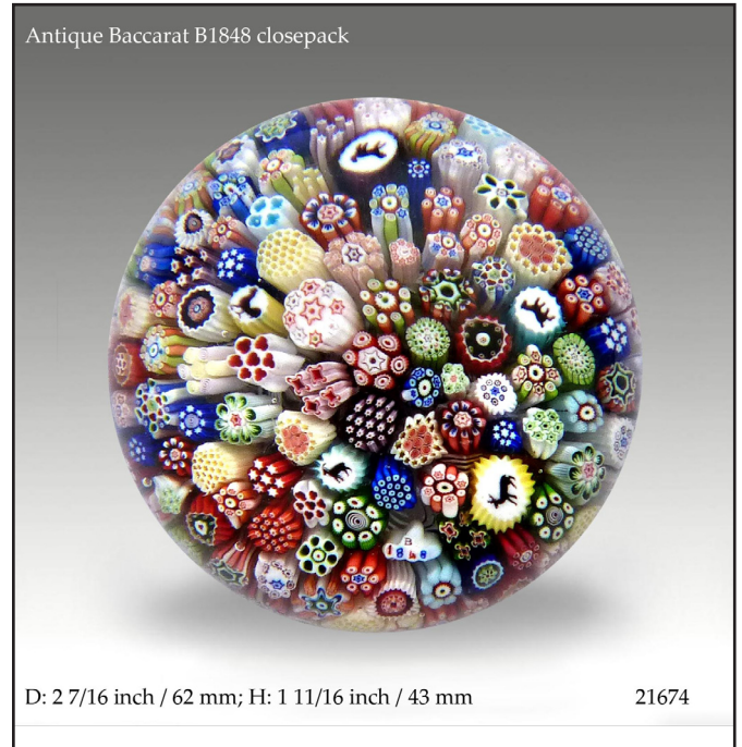
Figure 1 A good quality image of an antique Baccarat closepack.

I have used an old 5 litre white spirit container; but now use a waste paper basket! I also use a small stand to raise the paperweight a little into the air and allow some light to reach the underside - this can be an advantage for clear or translucent paperweights. The small stand shown in Figure 2 originally held a Christmas chocolate - from Thorntons, naturally! I know some collectors place a mirror beneath the weight for the same purpose.