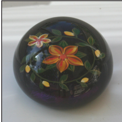
Figure 6 A poor quality, dull image showing reflections.

The set-up I use for angled images, with a graded grey background. The garden fleece can be drawn forwards to help stop reflections of objects in front of the set-up.