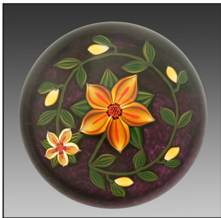
Figure 11 Graded grey background.

To illustrate the points I have shown images of a Perthshire paperweight which has a dark translucent purple ground - it is not easy to photograph, as the ground can appear black unless some light is allowed to come from underneath by placing it on a clear support.