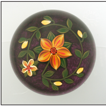
Figure 9 Colour balanced and image sharpened.